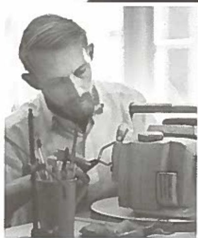
Inducted: 2003 Years at GCI & VS: 1951 - 1955